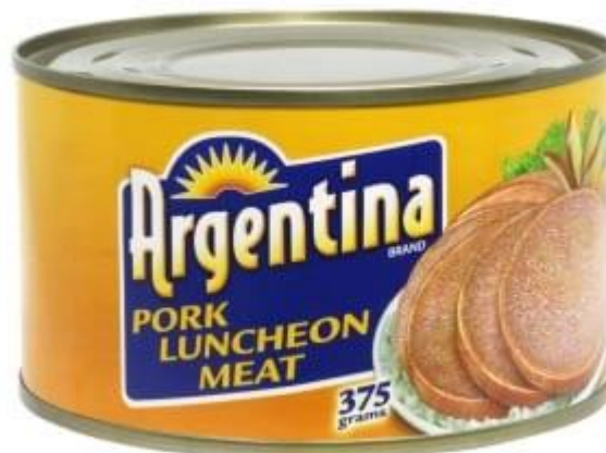
ARGENTINA (PORK LUNCHEON MEAT)