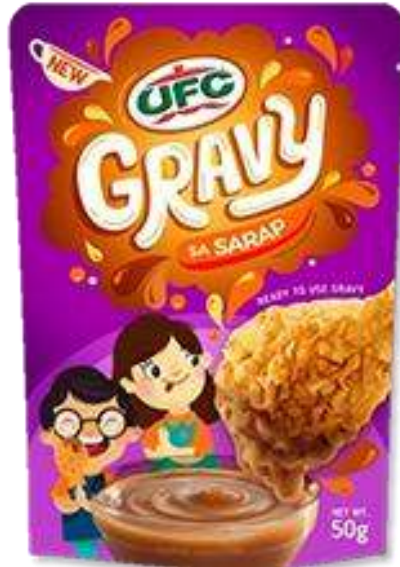
UFC GRAVY SA SARAP