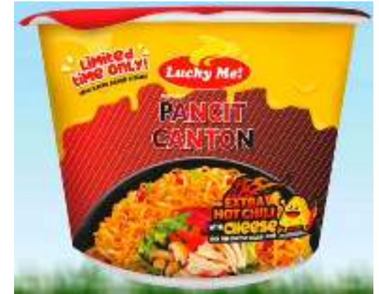
LUCKY ME PANCIT CANTOON (EXTRA HOT CHILI W/ CHEESE)