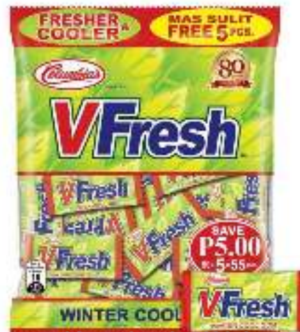
COLUMBIA'S V-FRESH (WINTER MELON)