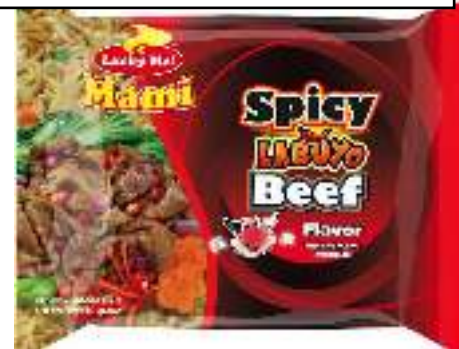
LUCKY ME MAMI (SPICY LABUYO BEEF)