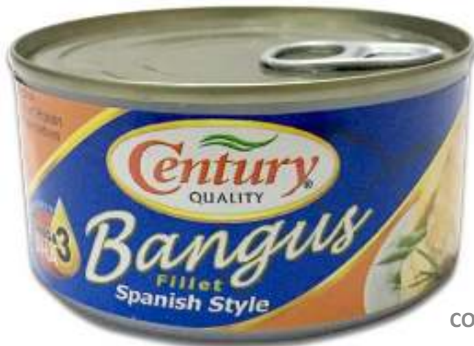
CENTURY BANGUS FILLET (SPANISH STYLE)