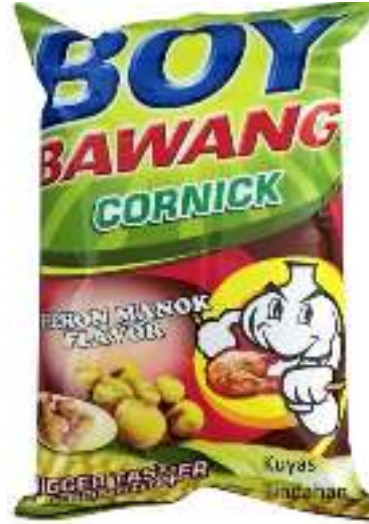
BOY BAWANG (LECHON MANOK FLAVOR)