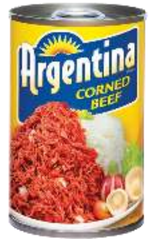
ARGENTINA (CORNEB BEEF)