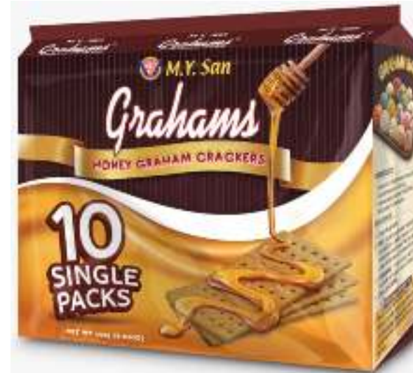
MY SAN GRAHAMS (HONEY GRAHAM CRACKERS 250g)