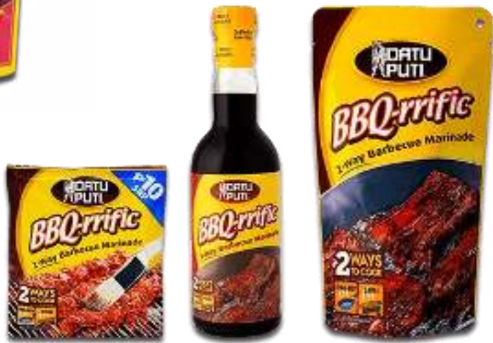
DATU PUTI (BARBEQUE MARINADE)