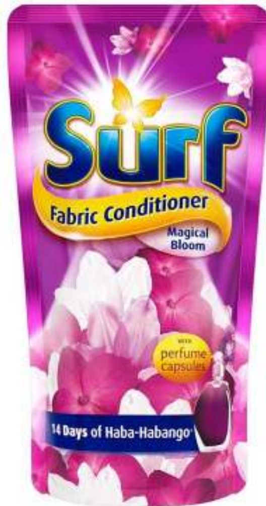
SURF FABRIC CONDITIONER (MAGICAL BLOOM)