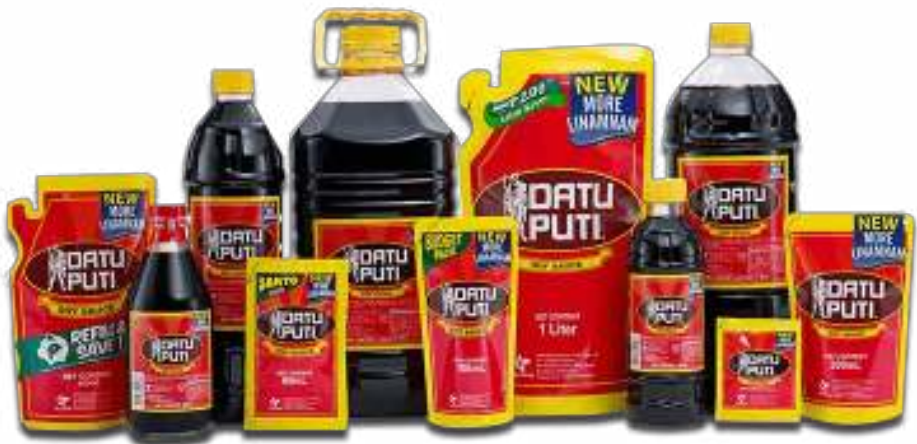
DATU PUTI (SOY SAUCE)