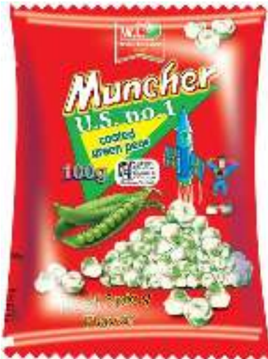
WL MUNCHER BEEF SPICY FLAVOR