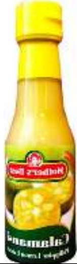
MOTHERS BEST (CALAMANSI)