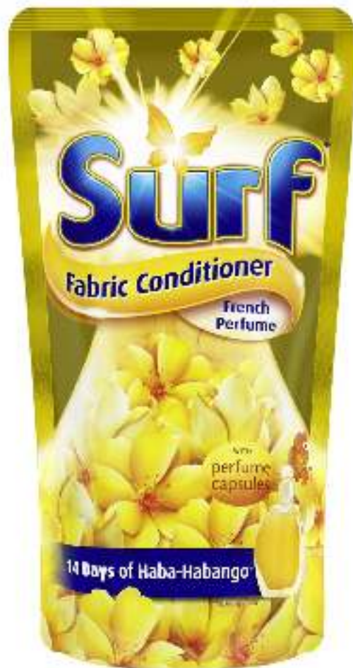
SURF FABRIC CONDITIONER (FRENCH PERFUME)