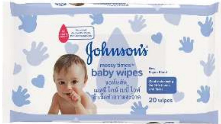
JOHNSON'S 20WIPES (MESSY TIMES BABY WIPES)