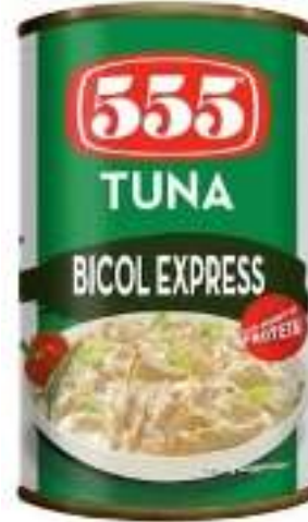
555 TUNA (BICOL EXPRESS)