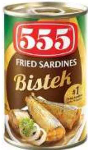
555 FRIED SARDINES (BISTEK)