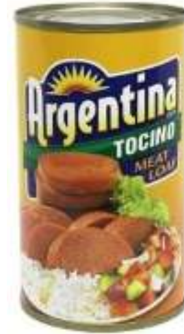
ARGENTINA (TOCINO MEAT LOAF)