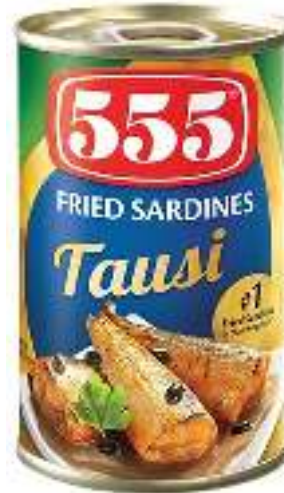
555 FRIED SARDINES (TAUSI)