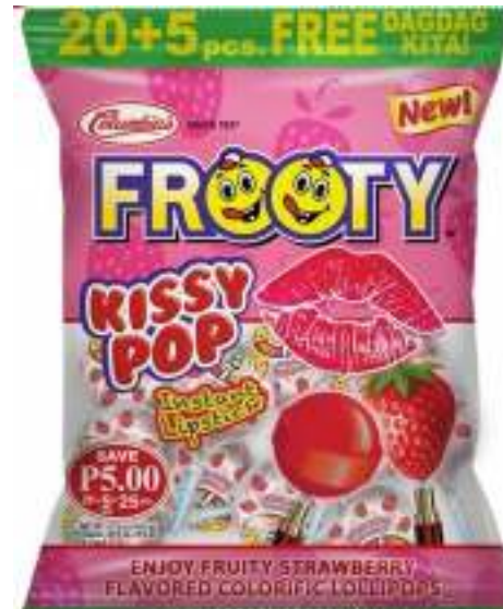
COLUMBIA'S FROOTY (KISSY POP)