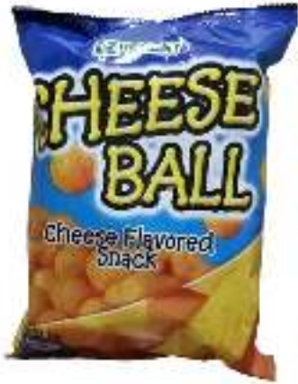
REGENT CHEESE BALL