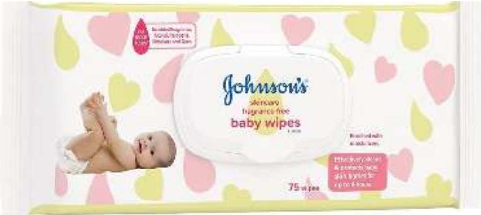
JOHNSON'S 75WIPES (SKINCARE FRAGRANCE FREE)