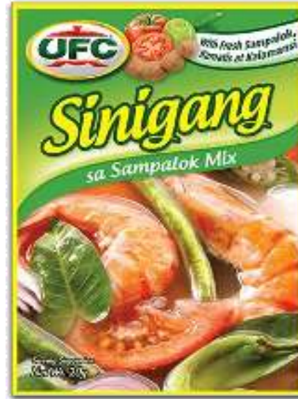
UFC SINIGANG SA SAMPALOK