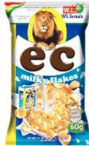
WL EC (MILKY FLAKES FLAVOR)