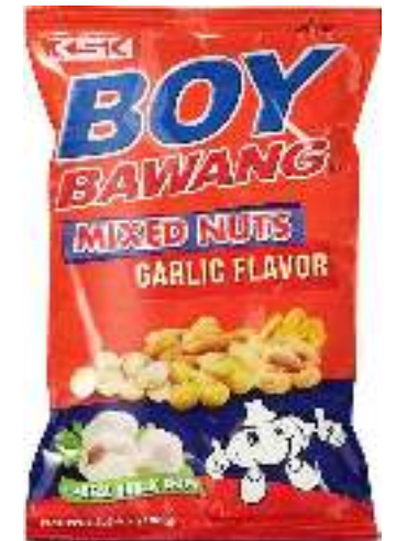
BOY BAWANG MIXED NUTS (GARLIC FLAVOR)