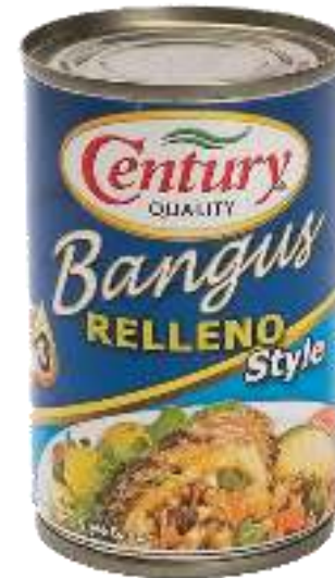
CENTURY BANGUS (RELLENO STYLE)