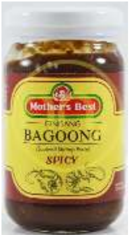
MOTHERS BEST (GINISANG BAGOONG SPICY)