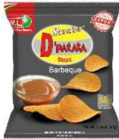
WL MUNCHER (D'PATATA CHIPS BBQ)