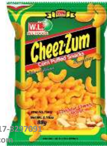
WL CHEEZ-ZUM (CORN PUFFED)