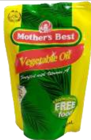
MOTHERS BEST (VEGETABLE OIL)