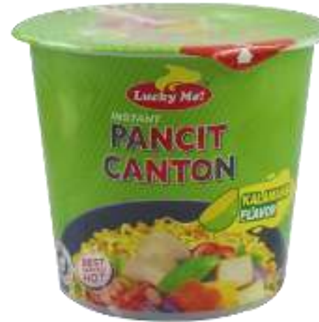
LUCKY ME (PANCIT CANTOON)