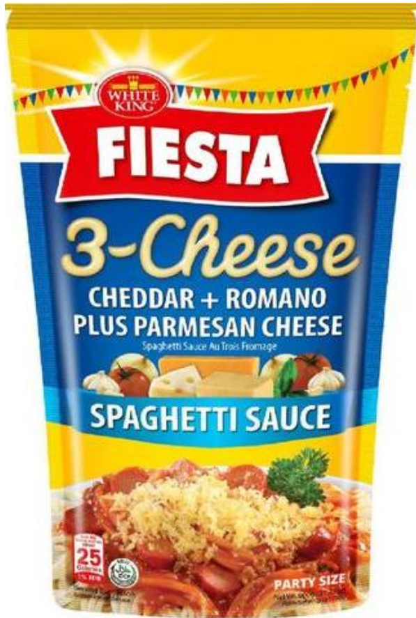
RFM FIESTA (3-CHEESE SPAGHETTI SAUCE)