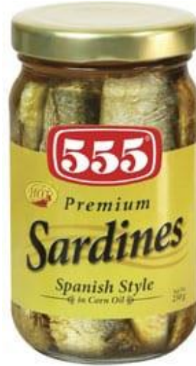
555 SARDINES (SPANISH PREMIUM BOTTLE)