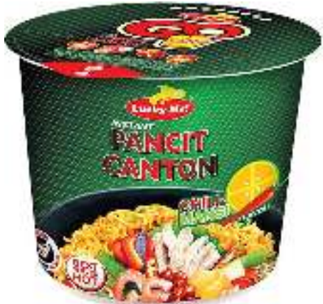
LUCKY ME (PANCIT CANTOON)