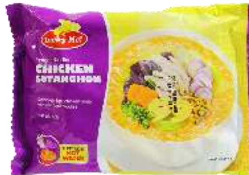
LUCKY ME (CHICKEN SOTANGHON)