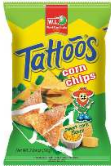
WL TATTOOS (SWEET CORN FLAVOR)