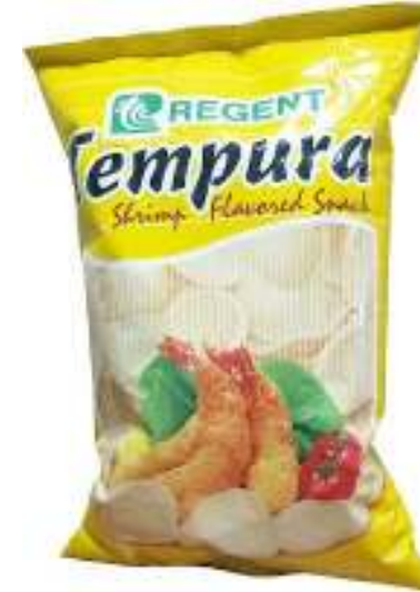
REGENT TEMPURA (SHRIMP FLAVOR)