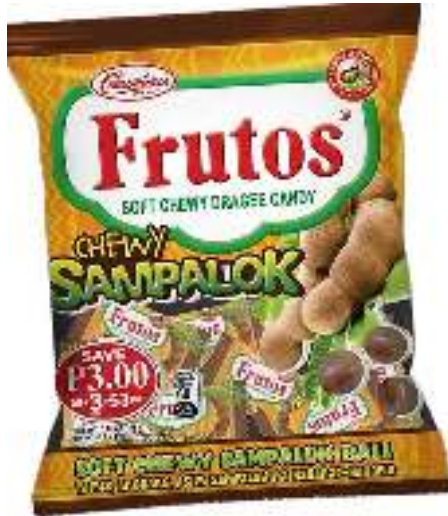
COLUMBIA'S FRUTOS (CHEWY SAMPALOK)