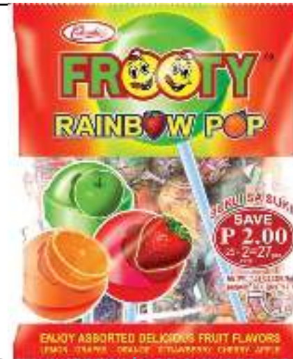
COLUMBIA'S FROOTY (RAINBOW POP)