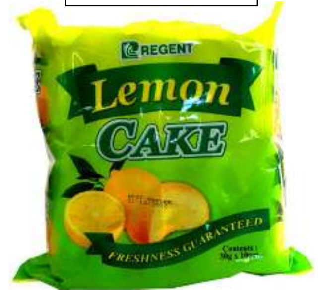
REGENT (LEMON CAKE)