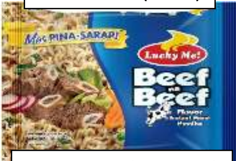
LUCKY ME (BULALO)