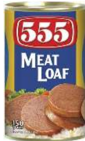
555 (MEAT LOAF)