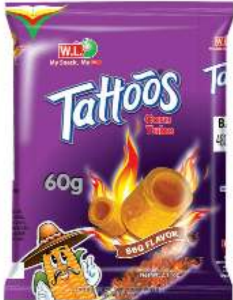
WL TATTOOS (BARBEQUE FLAVOR)