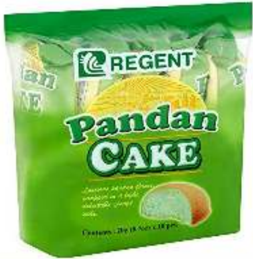
REGENT (PANDAN CAKE)