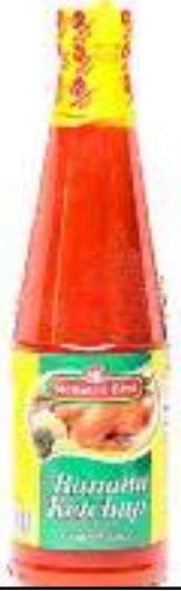
MOTHERS BEST (BANANA KETCHUP)