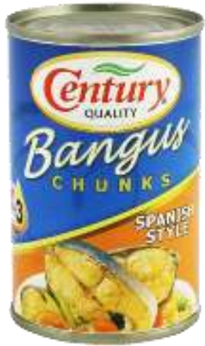
CENTURY BANGUS CHUNKS (SPANISH STYLE)