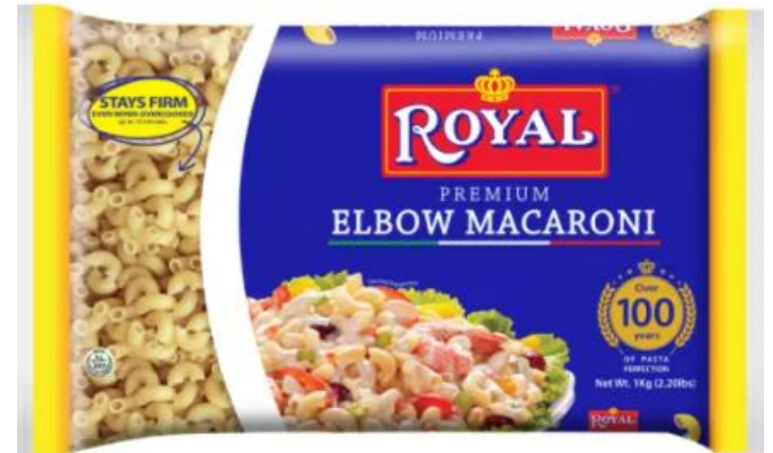
RFM ROYAL 1kg (PREMIUM ELBOW MACARONI)