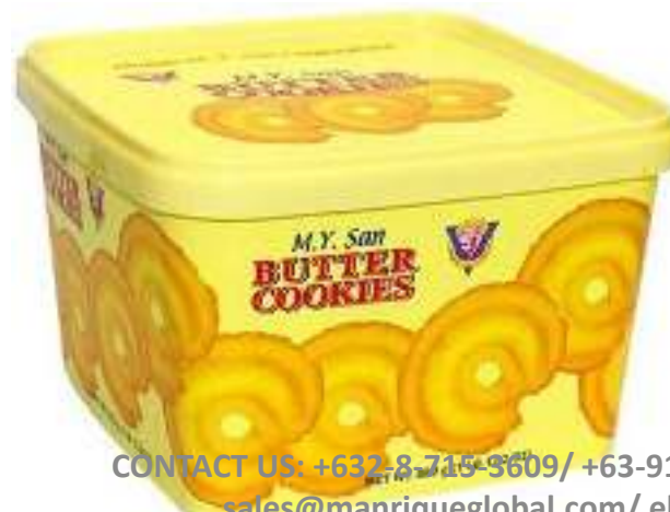
MY SAN (BUTTER COOKIES 800g)