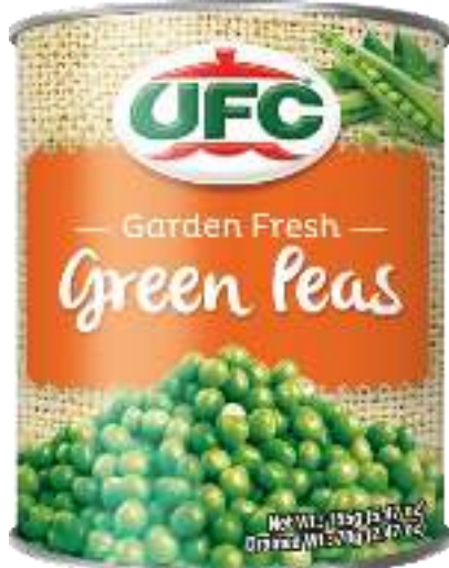
UFC GREEN PEAS