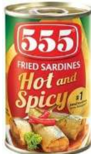
555 FRIED SARDINES (HOT AND SPICY)