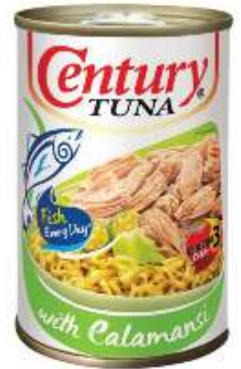
CENTURY TUNA (with CALAMANSI)