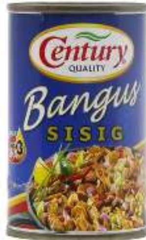
CENTURY BANGUS (SISIG)