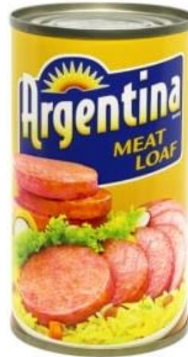
ARGENTINA (MEAT LOAF)