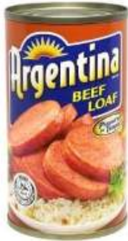
ARGENTINA (BEAF LOAF)