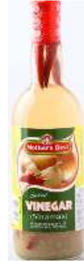
MOTHERS BEST (SPECIAL VINEGAR SINAMAK)