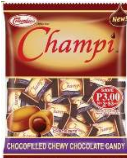
COLUMBIA'S CHAMPI (CHOCOLATE CHEWY CANDY)