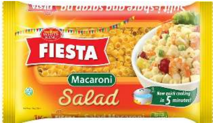
RFM FIESTA1kg (MACARONI SALAD)