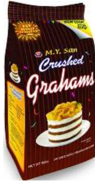
MY SAN GRAHAMS (CRUSHED 200g)