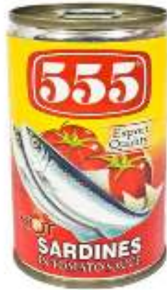
555 SARDINES IN TOMATO SAUCE (HOT)