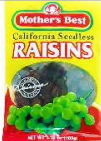
MOTHERS BEST CALIFORNIA SEEDLESS (RAISINS)