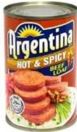
ARGENTINA (HOT AND SPICY)