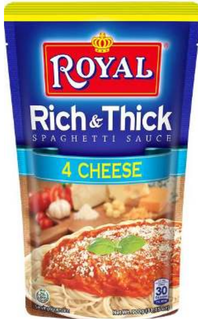
RFM ROYAL 900g (4 CHEESE SPAGHETTI SAUCE)