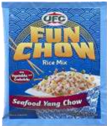
UFC FUN CHOW