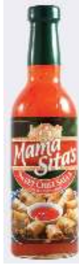
MAMA SITA'S (SWEET CHILI SAUCE)