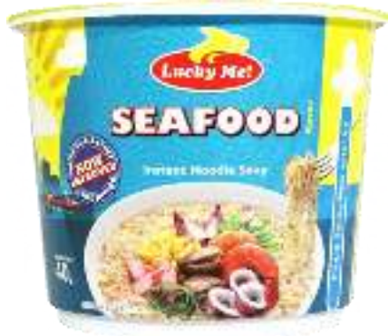
LUCKY ME (SEAFOOD)