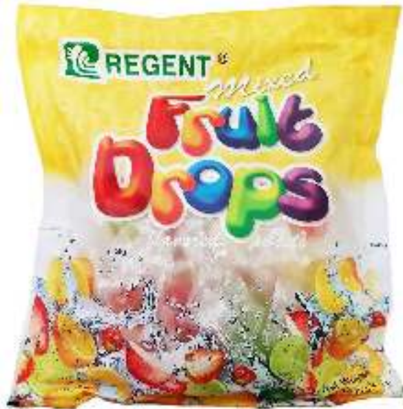
REGENT FRUIT DROPS