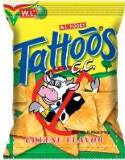
WL TATTOOS (CHEESE FLAVOR)