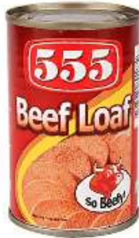
555 BEEF LOAF