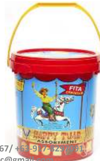
MY SAN FITA CRACKERS (HAPPY TIME ASSORTMENT)