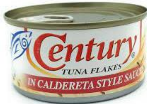
CENTURY TUNA FLAKES (IN CALDERETA STYLE SAUCE)