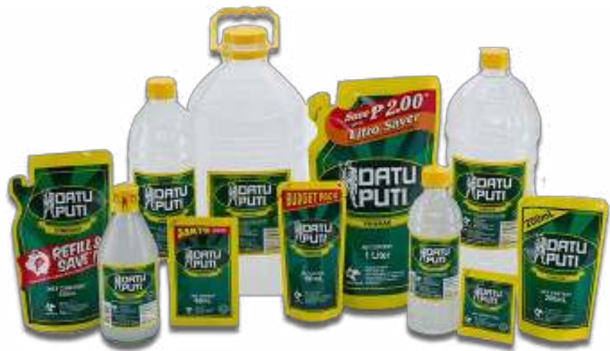
DATU PUTI (VINEGAR)