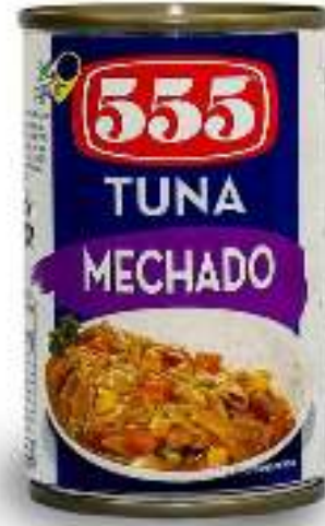
555 TUNA MECHADO