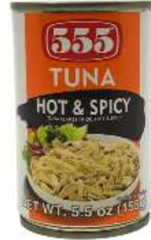
555 TUNA (HOT & SPICY)