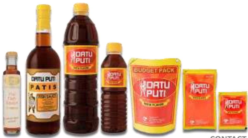
DATU PUTI (FISH SAUCE)