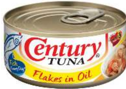
CENTURY TUNA FLAKES IN OIL (REGULAR)