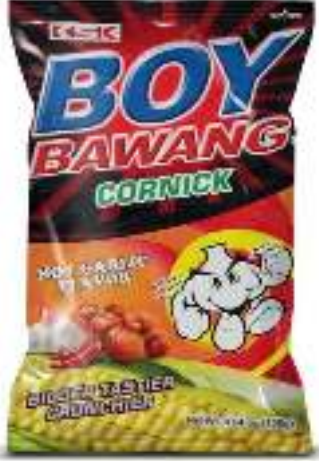
BOY BAWANG (HOT GARLIC FLAVOR)