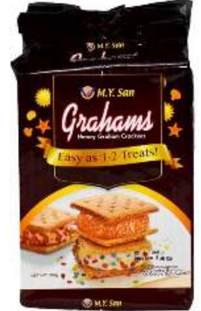
MY SAN GRAHAMS 200g