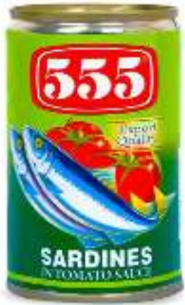
555 SARDINES IN TOMATO SAUCE