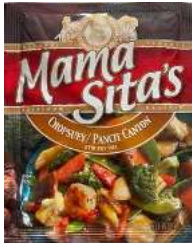
MAMA SITA'S (CHOPSUEY/PANCIT CANTON)