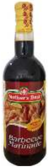
MOTHERS BEST (BARBEQUE MARINADE)