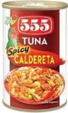
555 TUNA (SPICY CALDERETA)