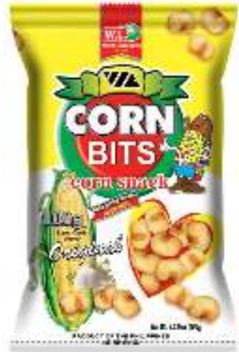
WL CORN BITS