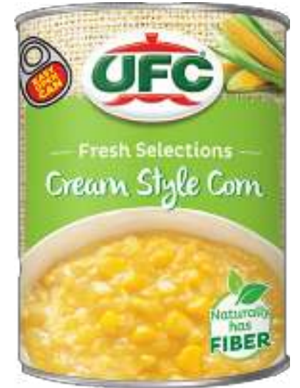
UFC CREAM STYLE CORN