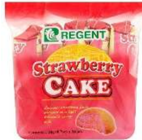
REGENT (STRAWBERRY CAKE)