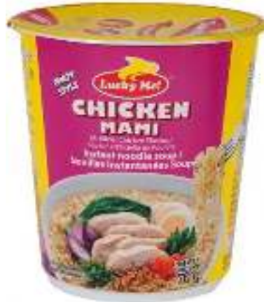
LUCKY ME (CHICKEN MAMI)