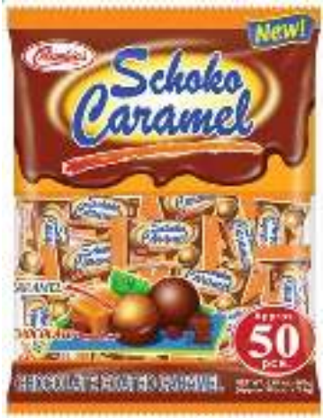
COLUMBIA'S SCHOKO CARAMEL (CHOCOLATE COATED CARAMEL)