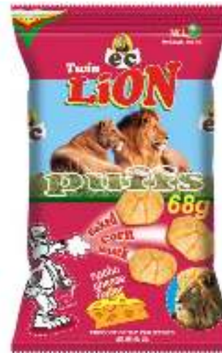
WL EC TWIN LION (NACHO CHEESE FLAVOR)