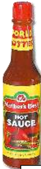
MOTHERS BEST (HOT SAUCE)