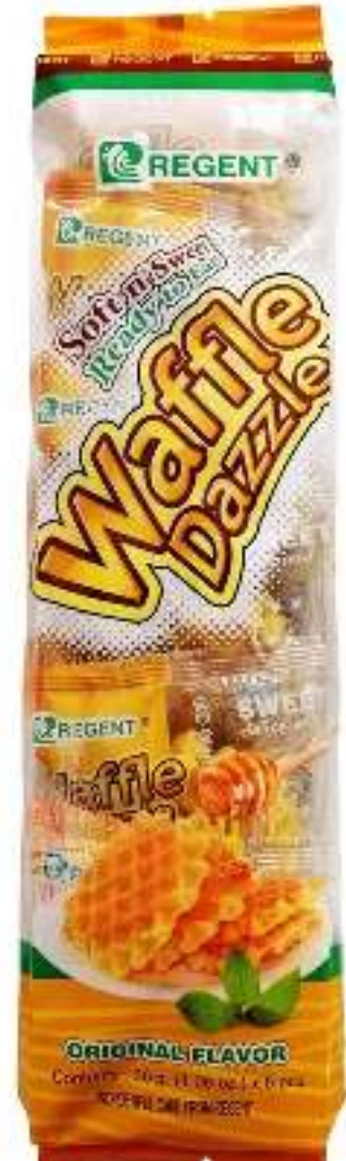
REGENT WAFFLE (DAZZLE)

CONTACT US: +632-8-715-3609/ +63-9173166067/ +63-917-8297091 sales@manriqueglobal.com/ ellen.mgec@gmail.com