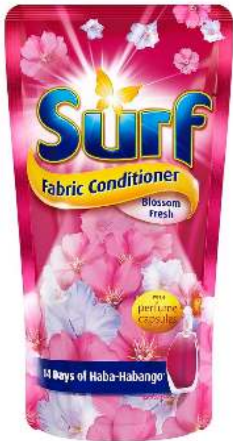
SURF FABRIC CONDITIONER (BLOSSOM FRESH)