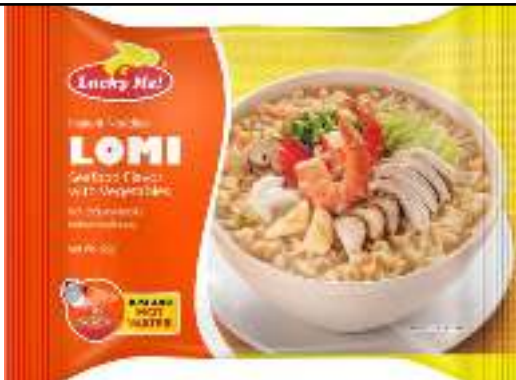
LUCKY ME LOMI (SEAFOOD FLAVOR W/VEGETABLES)