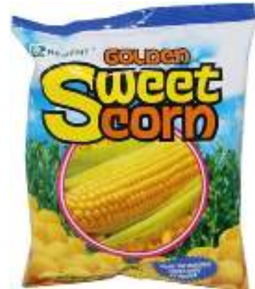
REGENT (GOLDEN SWEET CORN)