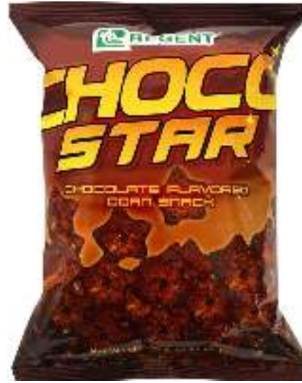
REGENT (CHOCO STAR)