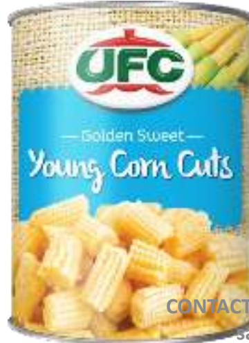
UFC YOUNG CORN CUTS