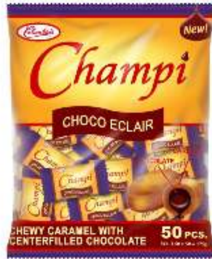
COLUMBIA'S CHAMPI (CHOCO ECLAIR)