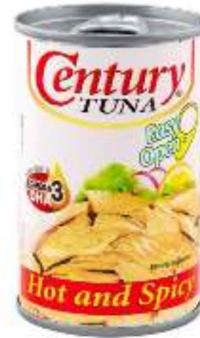
CENTURY TUNA FLAKES IN OIL (HOT AND SPICY)