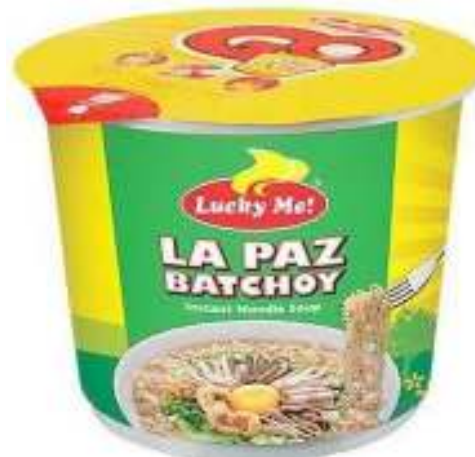
LUCKY ME (LA PAZ BATCHOY)