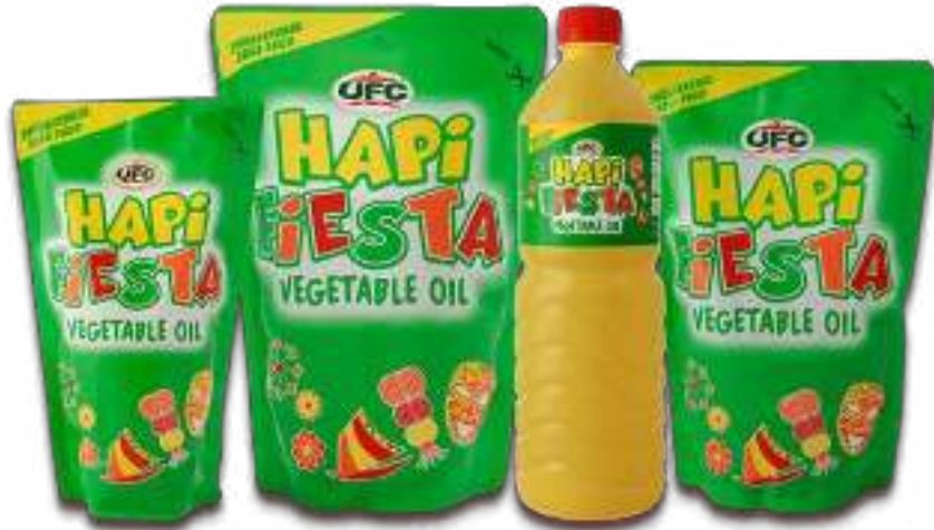
UFC HAPI FIESTA VEGETABLE OIL