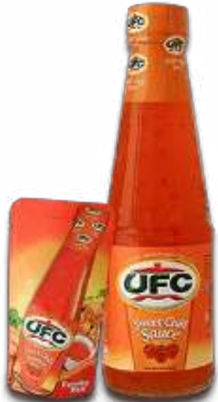
UFC SWEET CHILI SAUCE