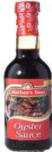
MOTHERS BEST (OYSTER SAUCE)