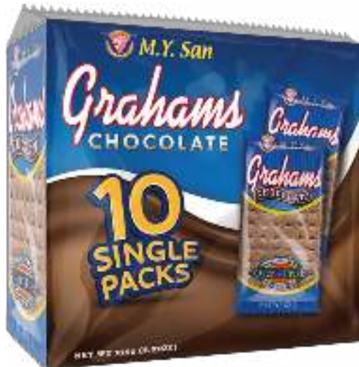
MY SAN GRAHAMS (CHOCOLATE 250g)