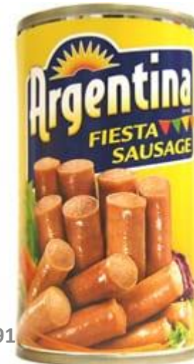
ARGENTINA (FIESTA SAUSAGE)