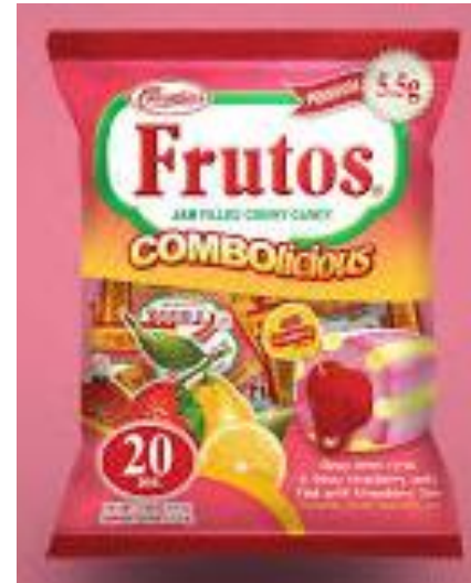
COLUMBIA'S FRUTOS (COMBOLICIOUS)