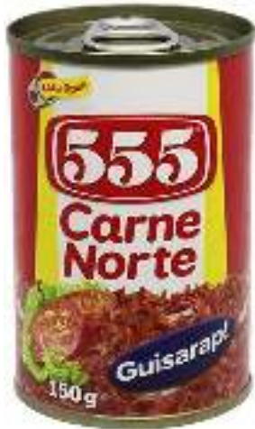
555 (CARNE NORTE)