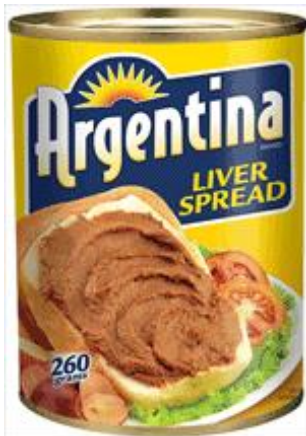
ARGENTINA (LIVER SPREAD)