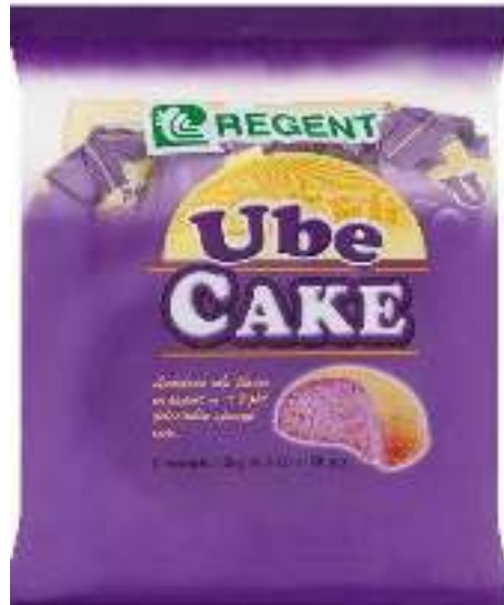
REGENT (UBE CAKE)