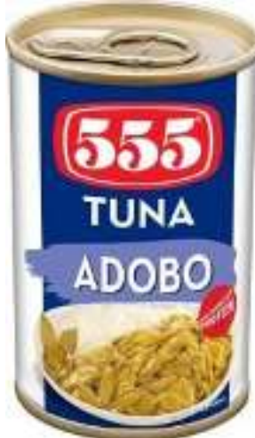
555 TUNA (ADOBO)