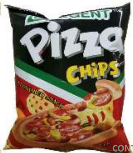
REGENT (PIZZA CHIPS)