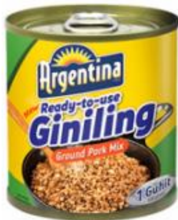
ARGENTINA (READY TO USE GINILING)