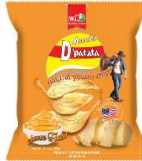
WL MUNCHER (D'PATATA CHEESE FLAVOR)