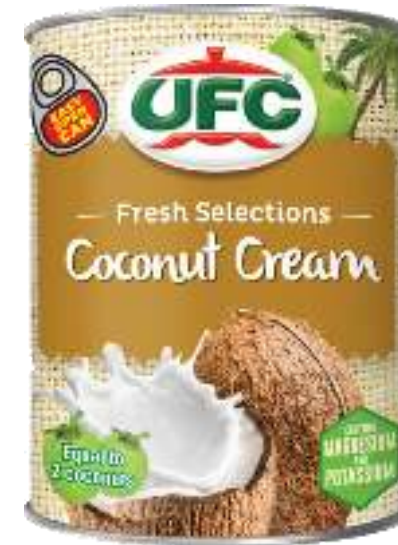
UFC COCONUT CREAM