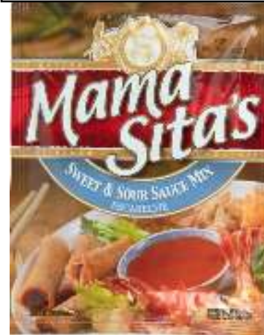
MAMA SITA'S (SWEET & SOUR MIX)