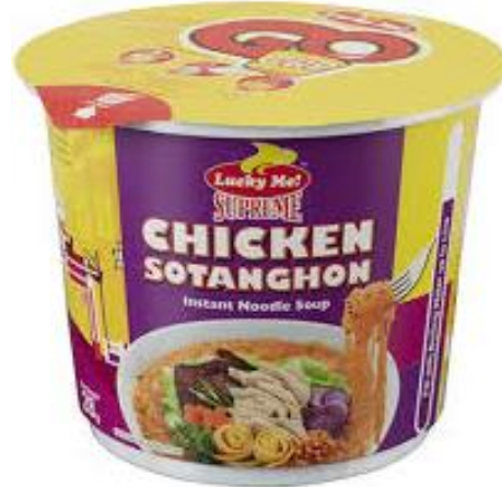
LUCKY ME (CHICKEN SOTANGHON)