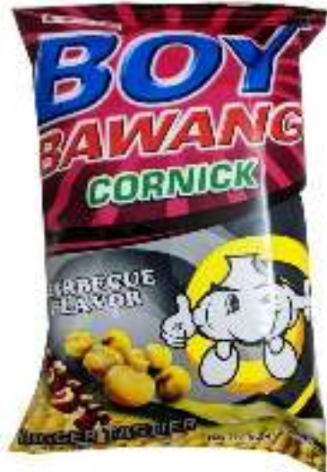
BOY BAWANG (BARBEQUE FLAVOR)