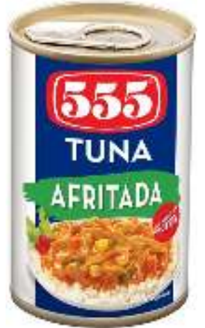
555 TUNA AFRITADA