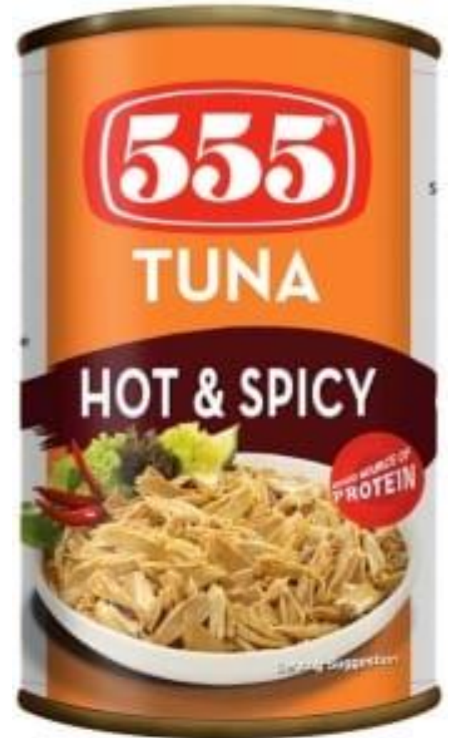
555 TUNA (HOT AND SPICY)