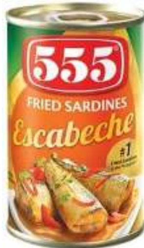
555 FRIED SARDINES (ESCABECHE)