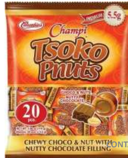
COLUMBIA'S CHAMPI TSOKO PNUTS (CHOCOLATE CHEWY CANDY)