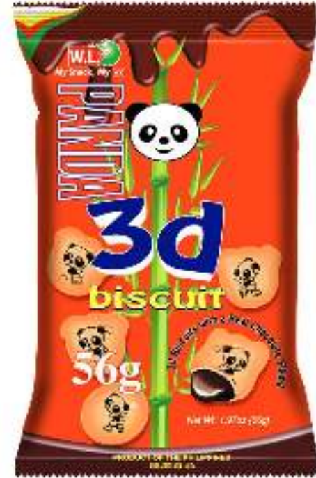
WL PANDA 3D BUSCUIT

CONTACT US: +632-8-715-3609/ +63-9173166067/ +63-917-8297091 sales@manriqueglobal.com/ ellen.mgec@gmail.com