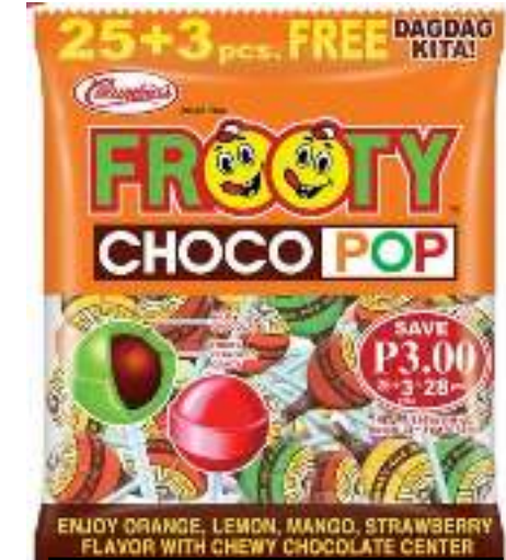
COLUMBIA'S FROOTY (CHOCO POPS)