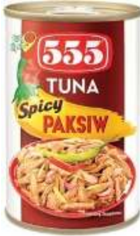
555 TUNA (SPICY PAKSIW)