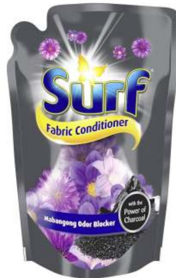
SURF FABRIC CONDITIONER (CHARCOAL FRESH)