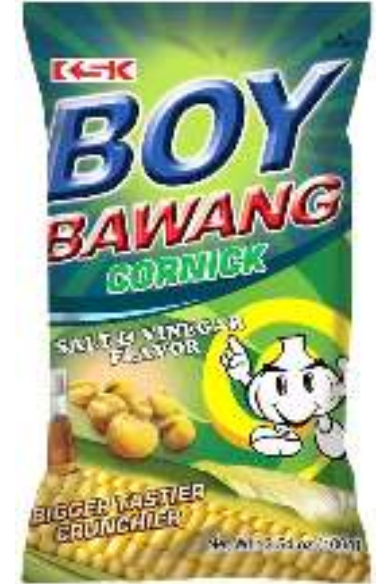
BOY BAWANG (SALT AND VINEGAR FLAVOR)