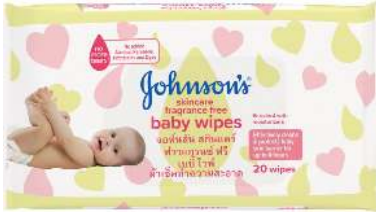
JOHNSON'S 20WIPES (SKINCARE FRAGRANCE FREE)