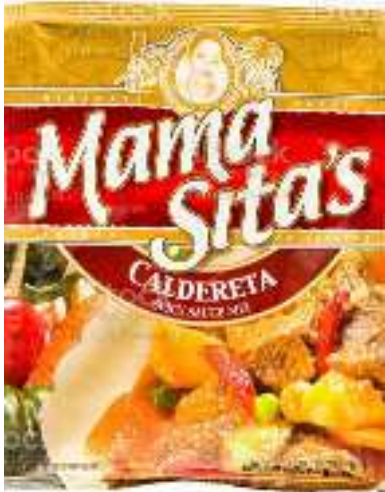
MAMA SITA'S (CALDERETA)