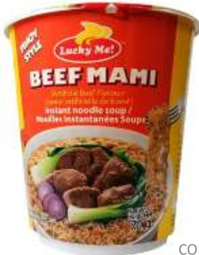
LUCKY ME (BEEF MAMI)