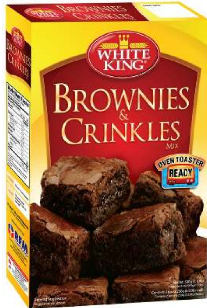
RFM WHITE KING (BROWNIES & CRINKLES)