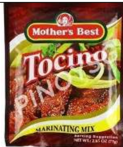
MOTHERS BEST (TOCINO MARINATING MIX)