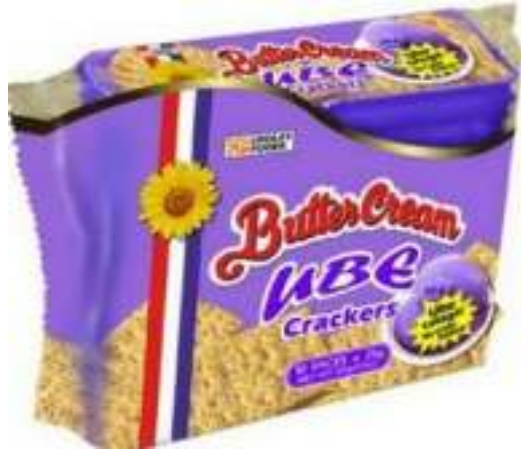
BUTTERCREAM (UBE FLAVOR)