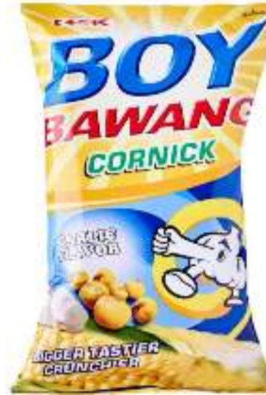
BOY BAWANG (GARLIC FLAVOR)