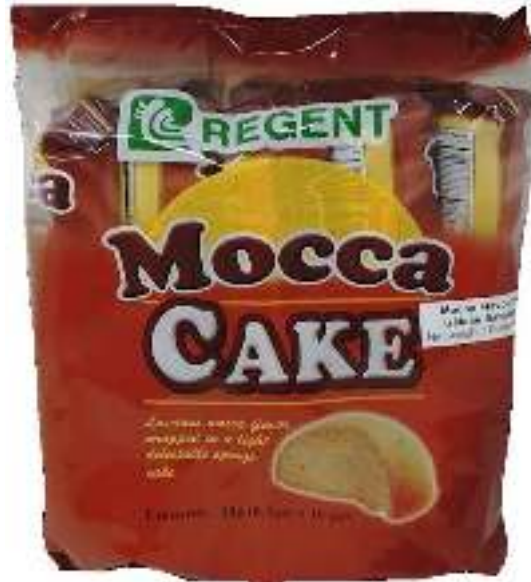
REGENT (MOCHA CAKE)