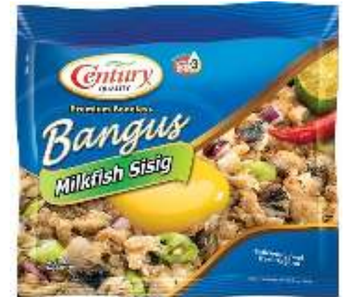
CENTURY BANGUS (MILKFISH SISIG)