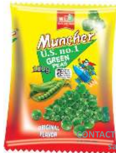
WL MUNCHER ORIGINAL FLAVOR