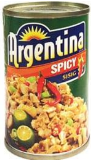
ARGENTINA (SPICY SISIG)