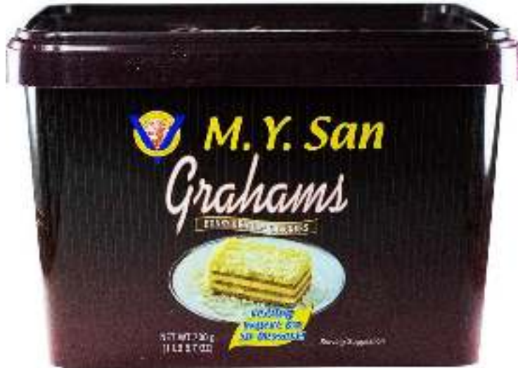
MY SAN GRAHAMS (IN A TUB 700g)