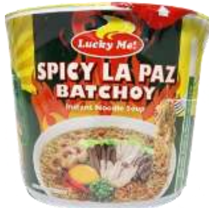
LUCKY ME (SPICY LA PAZ BATCHOY)