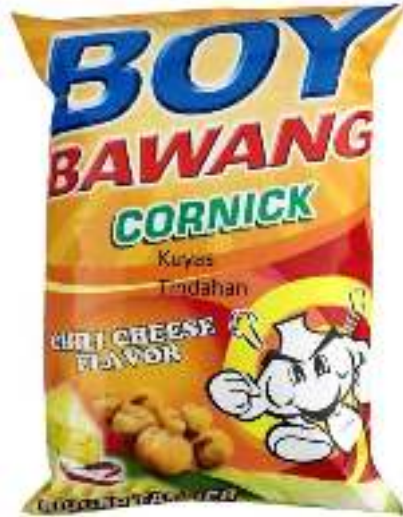
BOY BAWANG (CHILI CHEESE FLAVOR)