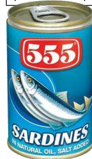
555 SARDINES (NATURAL OIL)