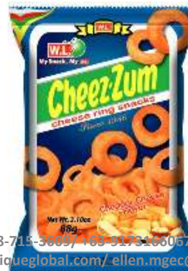
WL CHEEZ-ZUM (CHEESE RING)